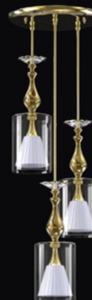
ANOMALY 05-CH | \varnothing 340 x H 1000 | 3 x G9