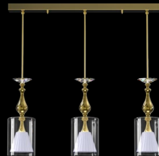
ANOMALY 06-CH | W 800 x D 150 x H 800 | 3 x G9