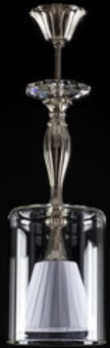
ANOMALY 01-CH | ø 150 x H 500 | 1 x G9