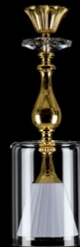
ANOMALY 04-CH | \varnothing 150 x H 500 | 1 x G9