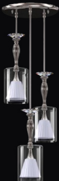
ANOMALY 02-CH | W 800 x D 150 x H 800 | 3 x G9