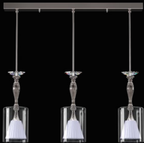
ANOMALY 03-CH | W 800 x D 150 x H 800 | 3 x G9