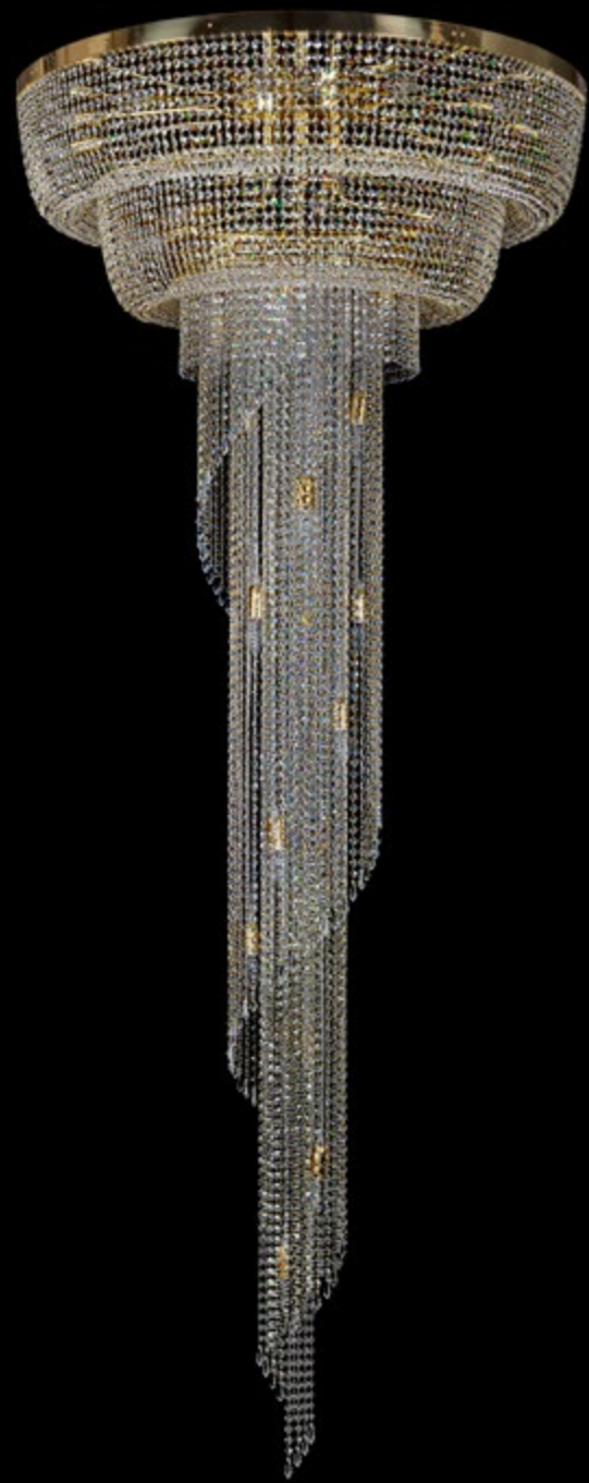
SPIRAL COLUMN 1000x2500 | 1000 x 2500 mm | 30 x 40 W